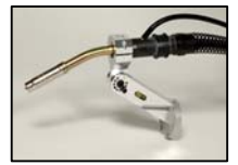
Complete torch holder (anti collision software)