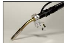
Torch bracket TCP 2 (CAT 2 holder)