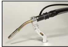
Torch bracket TCP 1 (CAT 2 holder)