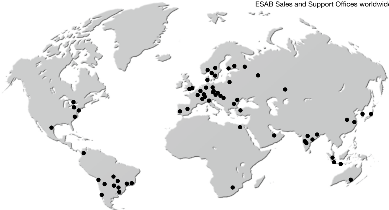
ESAB Sales and Support Offices worldwide

* Includes manufacturing facilities of ESAB North America, a wholly owned subsidiary of Anderson Group Inc.